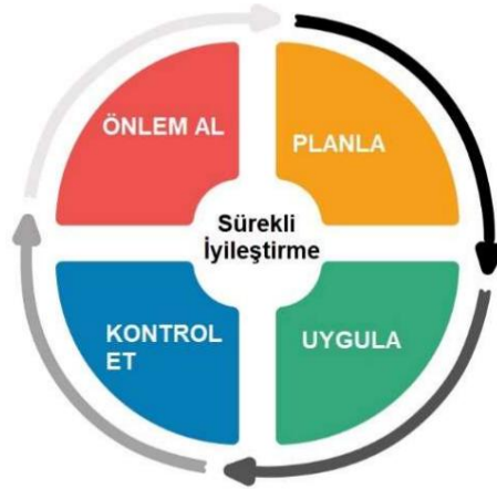
Figure 1. PDCA Cycle

Plan: Our hotel attaches importance to the environment, society, culture, national economy and management system and sets goals. It plans the roadmap and actions to be followed in order to achieve the determined goals.